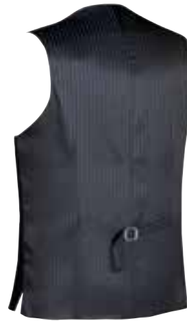
WAISTCOAT REAR DETAIL