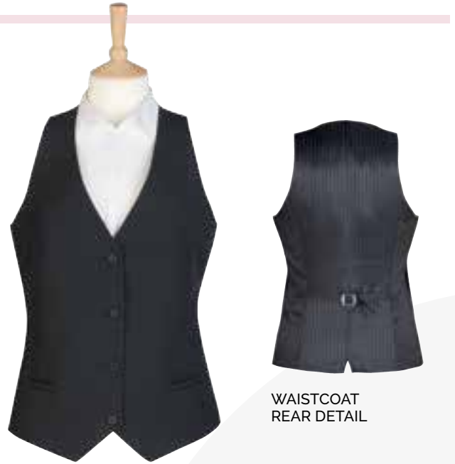
WAISTCOAT REAR DETAIL