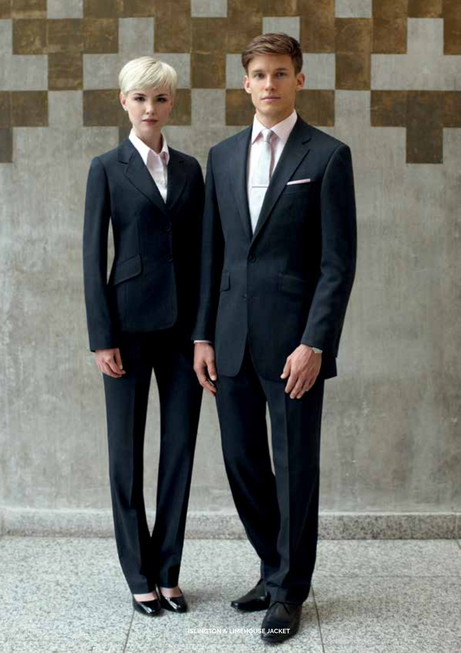
ISLINGTON & LIMEHOUSE JACKET